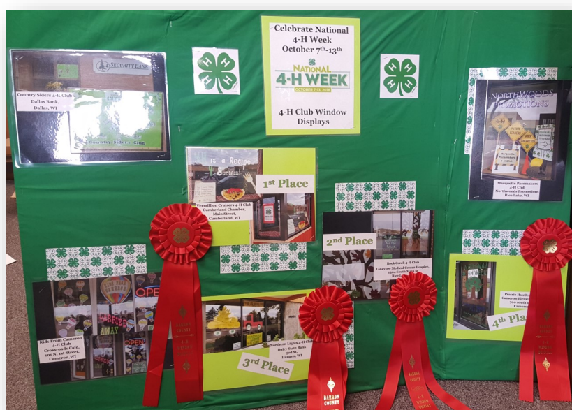
2018 National 4-H Week Window Display Winners