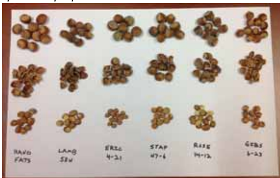
▲ The Bayfield Germplasm Trial is one of six in the Upper Midwest involved in finding locally-adapted germplasm to support the emerging hazelnut industry.