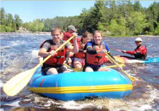
▲ Learning to take safe risks is an important life skill that this group of Junior Leaders experienced while whitewater rafting on the St. Louis River.