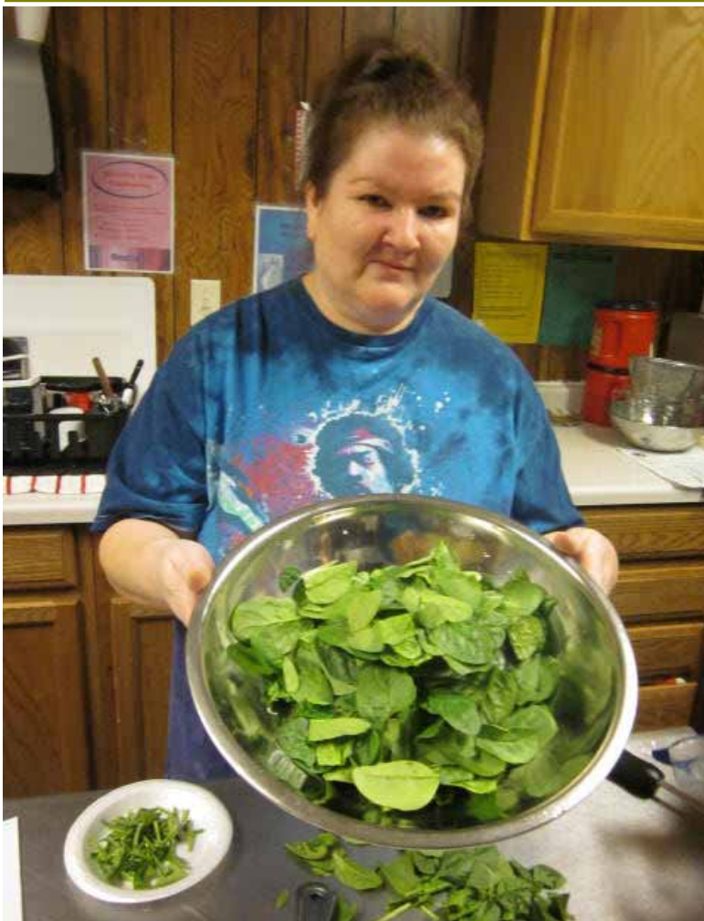
▲ Red Cliff Commodities partnered with WNEP to host cooking classes which provide opportunities for participants, many of whom are local parents or grandparents who are primary caregivers, to learn how to make healthy meals. Shown here is a fresh garden salad.