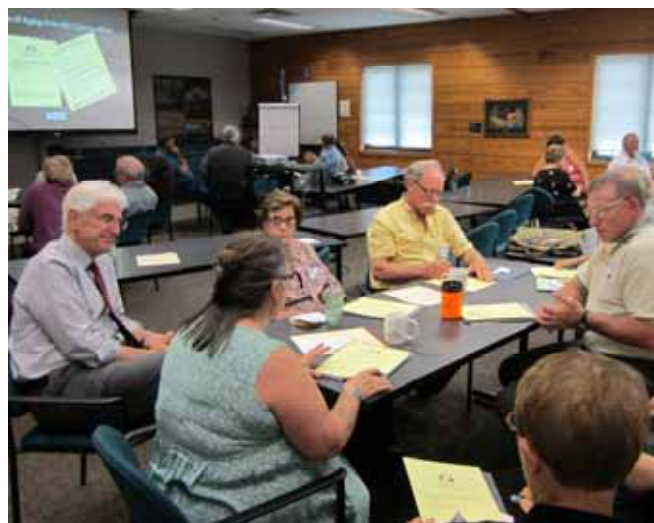
▲ Age Wave Workshop participants discuss the impacts of the County’s aging population.