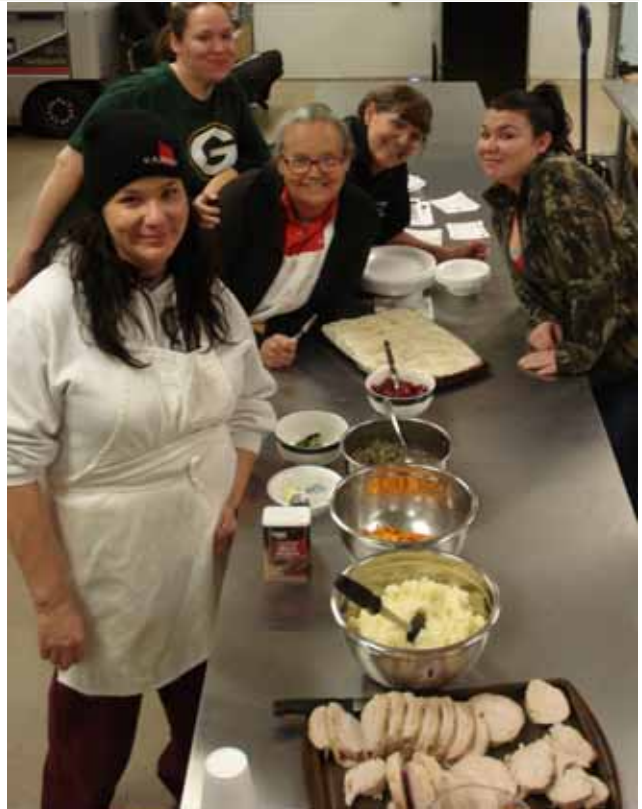
▲ WNEP teaches all age groups, from Head Start to Senior Centers. Here a WNEP educator did a recipe demonstration and provided nutrition education for local adults at a Thanksgiving cooking class at Red Cliff Commodities.

Adults all have skills and knowledge that they bring into a lesson and WNEP with the Food Distribution staff always leave having learned from the participants, too. Working closely with adults is an important way to help impact the health of families in Bayfield County.