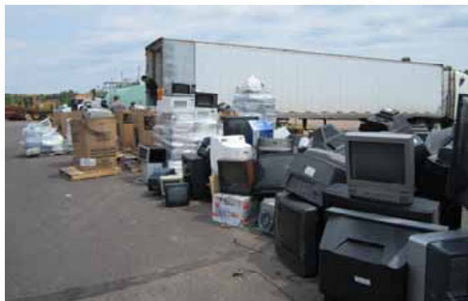
▲ Old electronic equipment brought to a Clean Sweep collection in Washburn.