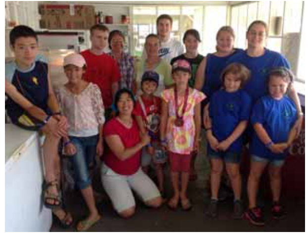
▲ Working in the 4-H Food Booth is the first experience many 4-H members have in a fast paced food service environment.