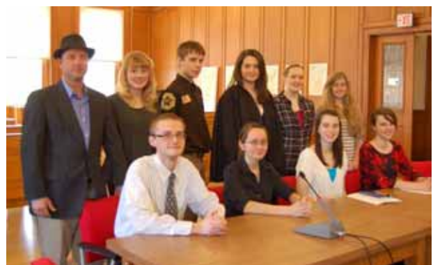
▲ The 2014 Law Day Narrative was designed to match the mock crash that took place at Bayfield High School. The Bayfield Teen Court prepared and performed a mock sentencing for 80 participating students.