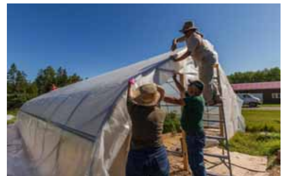
▲ Putting the plastic on the South Shore tunnel.