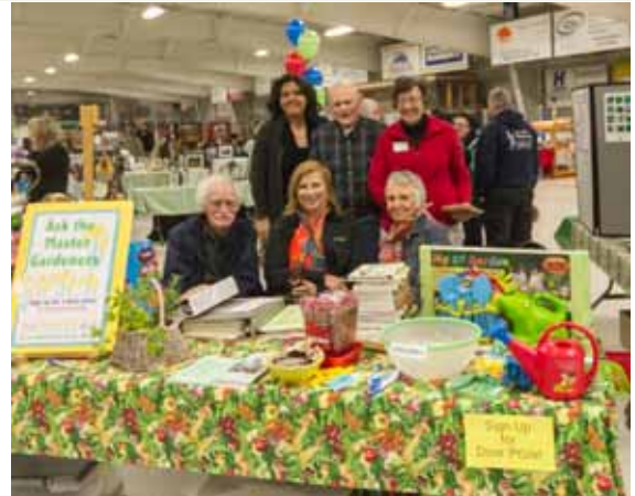
▲ Master Gardeners at the 2015 Farm and Garden show.