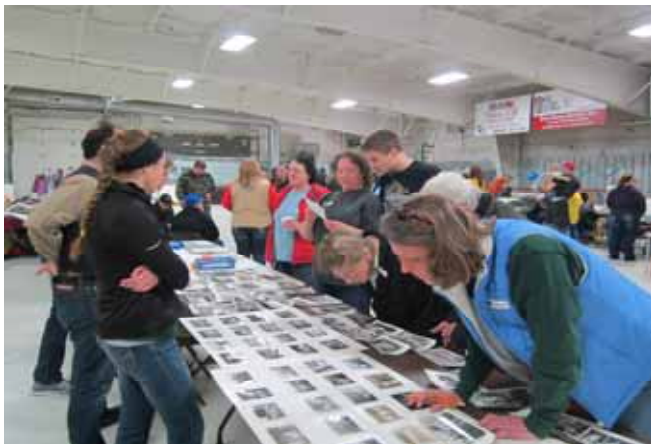
▲ 4-H Ambassadors spoke with 4-H Alumni who were drawn to the old Bayfield County 4-H photos on display at the Dairy Breakfast.