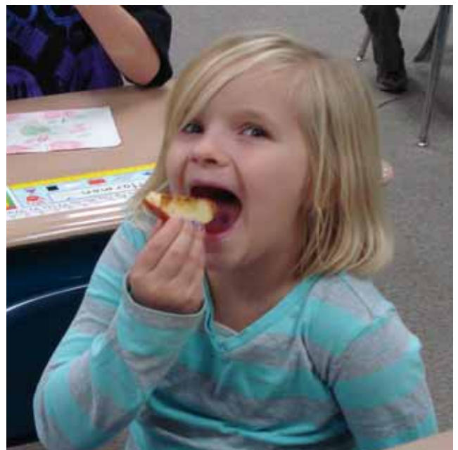
▲ Nutrition Education lessons provide different opportunities for children, such as this Drummond Elementary student, to try a sample of a new fruit idea such as an apple with cinnamon as a healthy snack alternative to junk food.