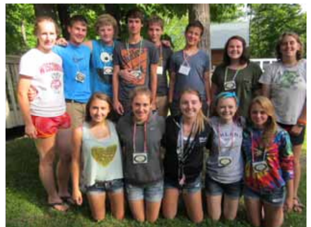
▲ 13 out of 14 High School 4-H Camp counselors have previously been 4-H campers themselves. This is a huge asset for training the counselors as they pass on their natural enthusiasm for camp to the next generation.