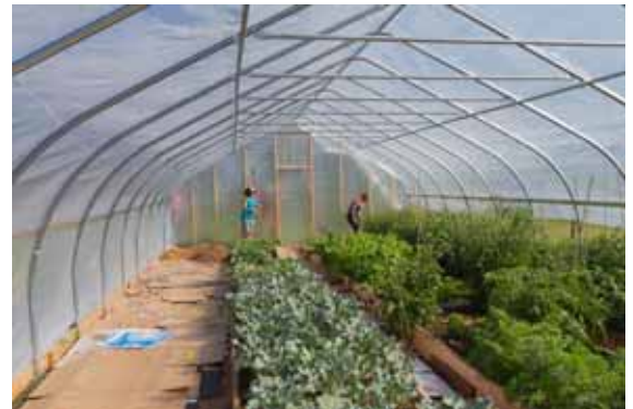
▲ Using cardboard for mulch at the South Shore high tunnel.