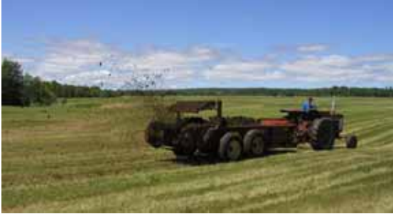
▲ A key aspect of nutrient management planning is making sure manure is spread at the right rates, right time, and right place.