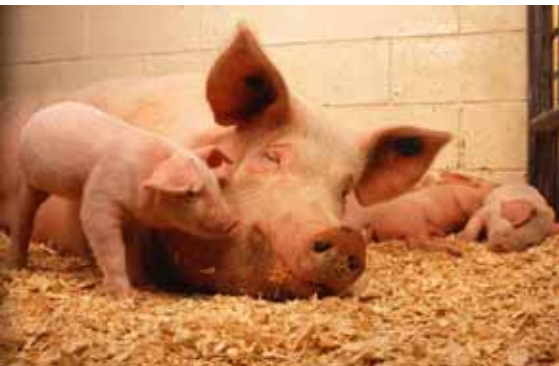
▲ Researching impact of CAFO-sized hog operation proposed for Town of Eileen.