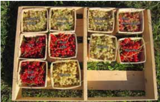
▲ Work with Bayfield fruit growers to evaluate available cultivars of red and white currants may help area growers diversify and become more profitable.