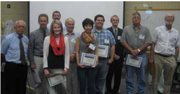
▲ Business Idea contest finalists pose for a group photo.